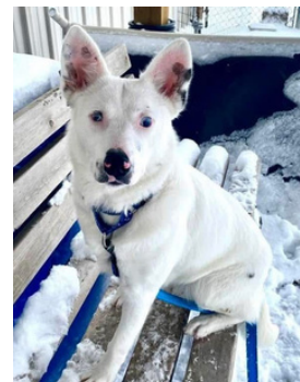
Ivy looking for a new best friend

Purina One Dog Food – canned and dry Frontline Plus for dogs Greenies Dental Chews Martingale collar/quick snap buckle Medicated pet shampoo Wet Swiffer pads Odoban or general-purpose cleaners Clorox spray and wipes Clorox Paper towels Trash bags Copy paper Postage stamps