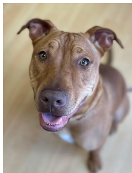
Leo has lots of love to give

Our needs are great for the volume of animals we care for at Angel Ridge. The Angel Ridge Amazon wish list is on our website at angelridgeanimalrescue.org . Please note that donations for the dogs or general office supplies should be delivered to: