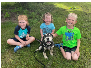
Hutch with his family

Rottie Alex came to us from a bad situation. It appears that Alex had congenital eye issues in both eyes, but the illness emerged one eye at a time. We were able to save his right eye with daily meds that he would need for a lifetime, but the left eye had to be removed. With the enucleation and the meds, his problems are over.