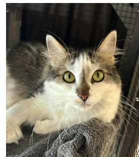
Gracie looking for love

Fancy Feast Canned Adult Food – no fish Delectables Broths Delectables Stews Delectables Bisques Fancy Feast Canned Kitten Food Purina Kitten chow - yellow bag Inaba Churu Cat Treats Frontline Plus for cats Nitrate Gloves, Medium or Large