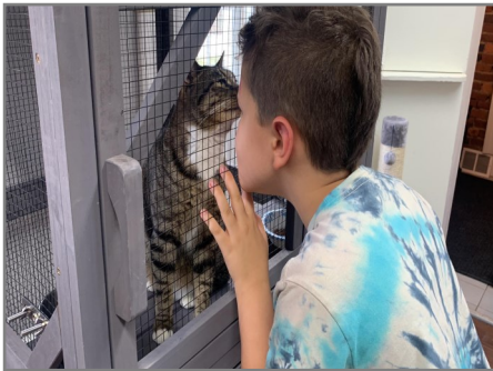
A special interaction

A quarantine room has been established for very young kittens, who are expected to be there about two weeks for observation, and if necessary, veterinary treatment prior to going into a foster home. Adult cats in need of isolation and veterinary treatment will use the room, too.