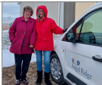
Polar Express engineers after a successful mission