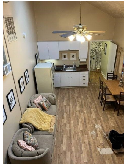
Lounge @ Buddy's real so-