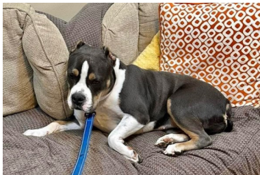
Mocha enjoying "couch-time"

The new dog space, now named Buddy's, after a long-time resident of the shelter, also offers two large play and rest areas for both the dogs and volunteers.