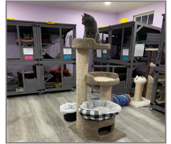
The enclosure room

November 5, 2023 was the Open House and Grand Opening of the new Bailey's Cat Haven, located at 2650 Brownsville Rd. South Park PA. What makes the new Bailey's so special, you may ask? It is a fun and cozy “almost home” for our adult cats while they wait for their new families to meet them and take them to their “forever home”. Bailey's meets the needs of cats in all situations.