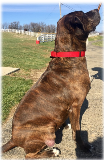
Isabella before surgery

Lab mix, senior dog Isabella, was abandoned along with another small dog, Baby, at a country market on Route 18 in Burgettstown. Baby was quickly adopted at Angel Ridge Animal Rescue. Sweet Isabella was introduced to several potential adopters, but they were wary of the large tumor that had grown in the rear of her body, and her Lyme's disease.