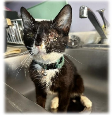
Curtis when found

The vet determined Curtis to be about a year old, even though he weighed less than four pounds. Curtis had a broken jaw, a mouth wound, wounds under his chin, a severe upper respiratory infection, an ulcer in one eye, and in the other eye, so much drainage that he could not open it.