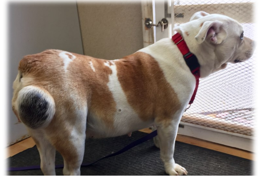
Poppy before surgery

“I would love to have a girl like Poppy to complete our family!”